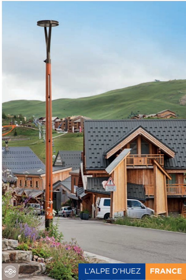
L'ALPE D'HUEZ FRANCE