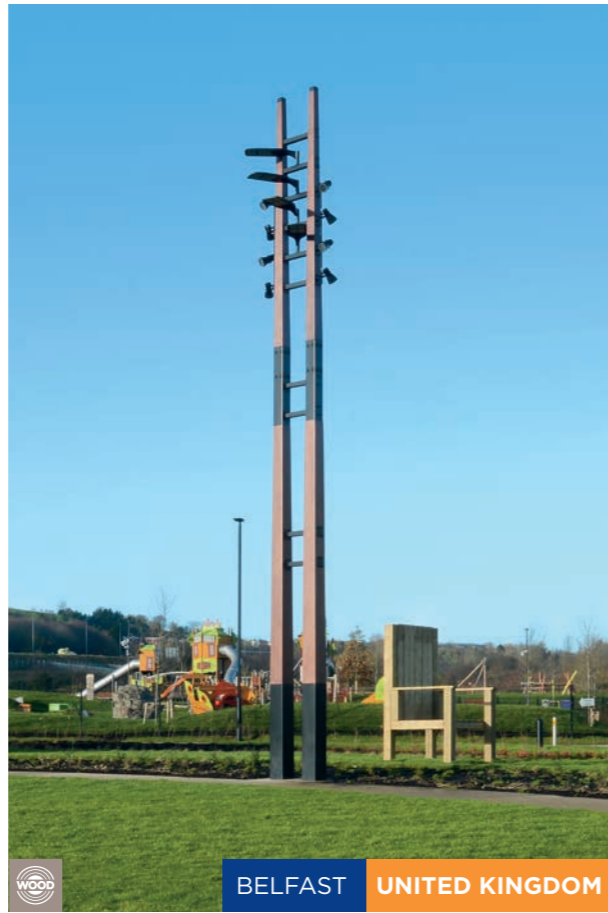
BELFAST UNITED KINGDOM