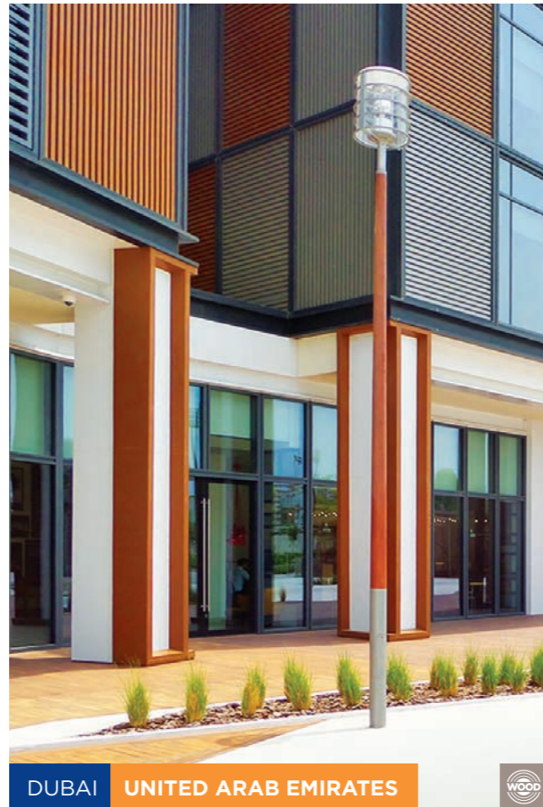
DUBAI UNITED ARAB EMIRATES